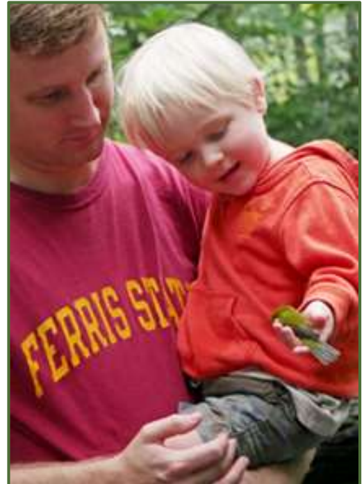
Wilson's warbler taking a rest on a visitor's hand before flying off.

Closing our second season fully open to the public, we had 444 visitors overall, 146 of which had never visited before . It was great to see many familiar faces, as well as new ones!