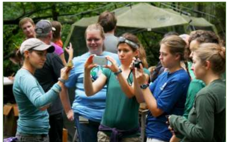
Veterinary students from Michigan State University learn about field research on wild birds.