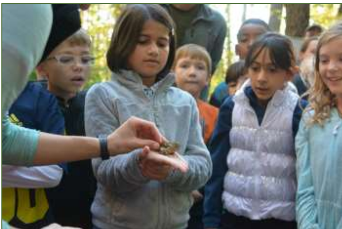
Third graders from Hiawatha Elementary school get some hands-on interaction with a Ruby-crowned Kinglet.